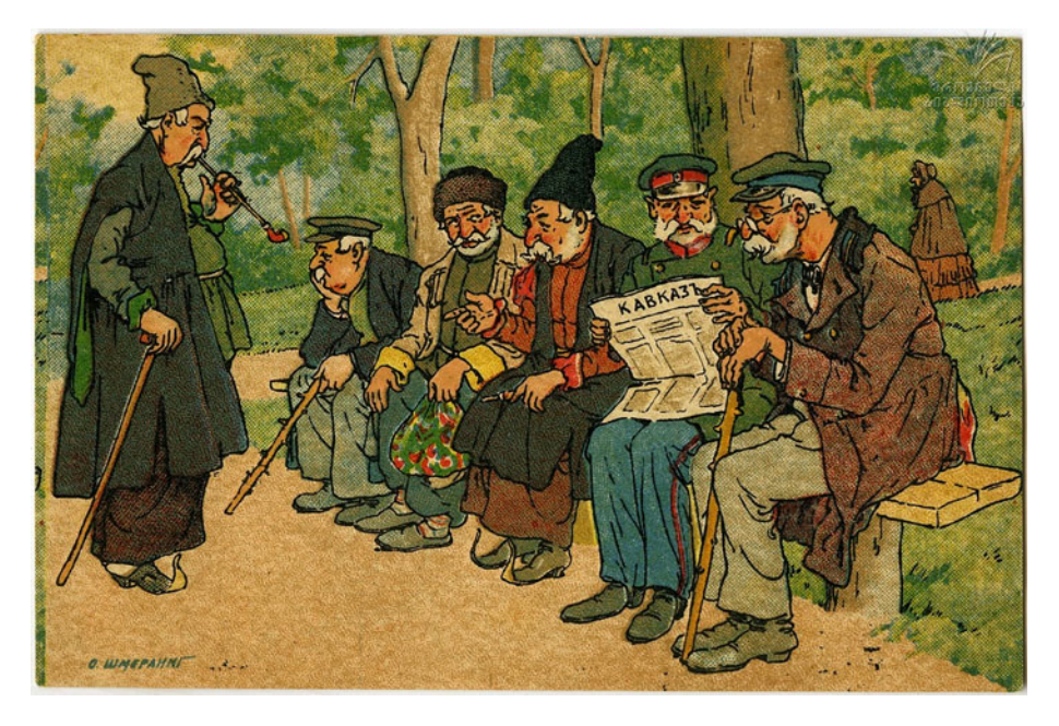
Figure 2. Old Tbilisi: In Alexander Garden. Oscar Schmerling, 1928; postcard, property of author.