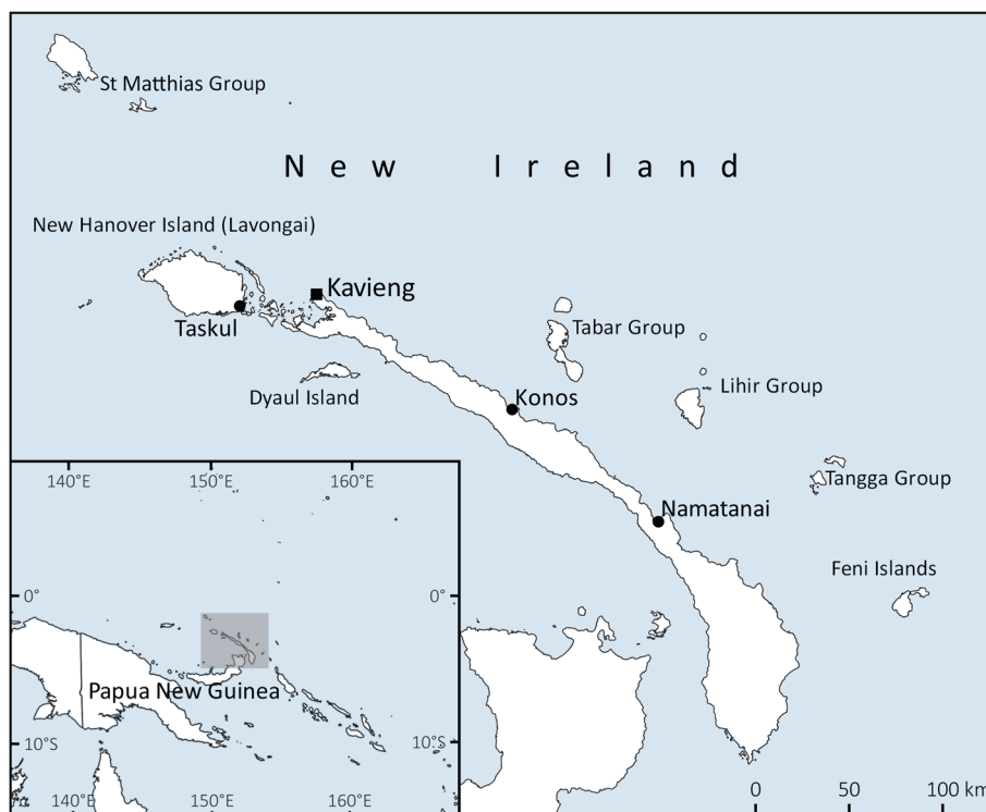
FIG. 1 New Ireland Province of Papua New Guinea.

Here we, a group of Indigenous scientists from both New Ireland and from other areas in Papua New Guinea, Indigenous Elders from New Ireland and international academics, describe an ongoing collaboration between Indigenous scientists and Elders from New Ireland with internationally based anthropologists to demonstrate an alternative methodology for the maintenance of marine system health and local livelihood sustainability. The methodology presented here is grounded in the traditional cultural practices of the region and focuses on the co-production of knowledge, and the valuing of Indigenous modes of relationality and temporality. Further, it is based on an understanding that for some Indigenous Peoples working towards marine system health, measures of success such as the strength of local spiritual practices and ethical multi-generational exchanges are as important as ecological and socio-economic measures. It grows out of work conducted by Ailan Awareness, an NGO in Papua New Guinea. In Melanesian Tok Pisin, the creole language spoken across Papua New Guinea, a country with over 800 Indigenous languages, ailan means island. This paper could appear unconventional in voice, style and presentation of