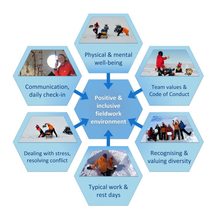
Figure 3. Visual representation of important topics covered during the ITGC facilitated pre-field season conversations to build a positive and inclusive field work culture.

social interaction tools to promote personal and introspective discussions between team members with respect to work-life balance, conflict recognition and resolution, and prospective roles and hierarchies in the field.