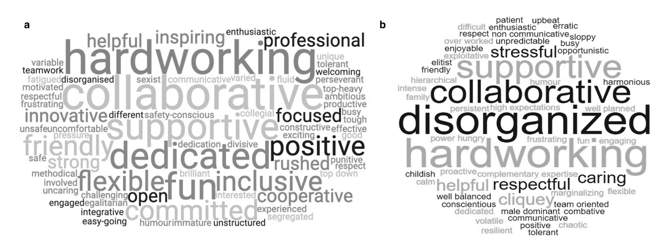
Figure 4. Word clouds describing perceptions of field team work culture from ITGC post-field season surveys reflecting the (a) 2019–20 and (b) 2021–22 seasons. The size of a word in the word cloud is proportional to the number of times the word appears in the input text from the surveys.

contractors, and scientists, which can assist with improving experiences and science outcomes, and (iv) the 'Community Norms and Values' and 'Field and Ship Best Practices' documents. When asked how supporting agencies can improve future field seasons, team members gave answers such as 'better communication', 'improve coordination between co-leaders', 'additional meetings for team building', and 'explain the role of different agencies involved.'