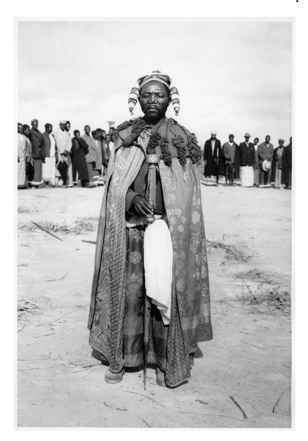
Illustration 1.1 Portrait of the ruler of Caculo Cacahenda with his advisors, early twentieth century. The photograph reveals the different textiles worn as well as the variety of symbols of power, including shoes, hats, and scepter.