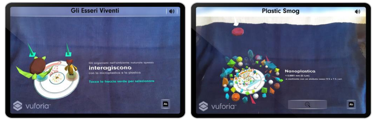
Figure 5. Living beings and plastic smog

"Plastic Smog" displays information about the classification of microplastics (Figure 5). To make this information tangible, it provides size comparisons and a visual representation of the composition of microplastic samples. This data is provided through a three-dimensional visual representation, which facilitates its comprehension and memorisation. The size of the particles is made tangible by comparing their dimension with the one of a well-known object, such as a hatpin and a blood cell, while their distribution per variety is represented by visually highlighting their proportion in a reference sample.