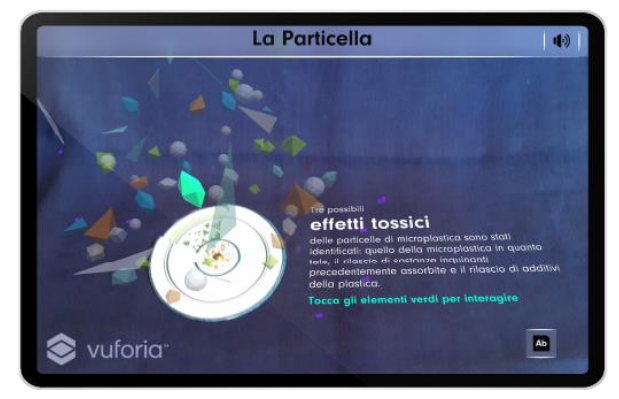
Figure 6. The particle

experience, organized in three steps, to discover the properties of a single microplastic particle. The first step introduces the user to the single particle, the second describes the absorption of toxic substances and the third the process of their release. The three-dimensional representation of the polluting process aids the comprehension of the information, making it less abstract and easier to memorise.