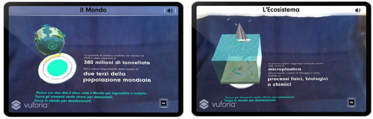
Figure 4. The world and the ecosystem

"Ecosystem" section represents a cross-section of the marine environment (Figure 4). In this section the user is free to explore the environment by tapping on each of the interactive elements, characterized by the recognizable material. The main goal of this step, besides informing the users, is to surprise them with a dynamic and detailed representation of the marine ecosystem which has the purpose of representing the complexity of the microplastics issue from a systemic point of view.