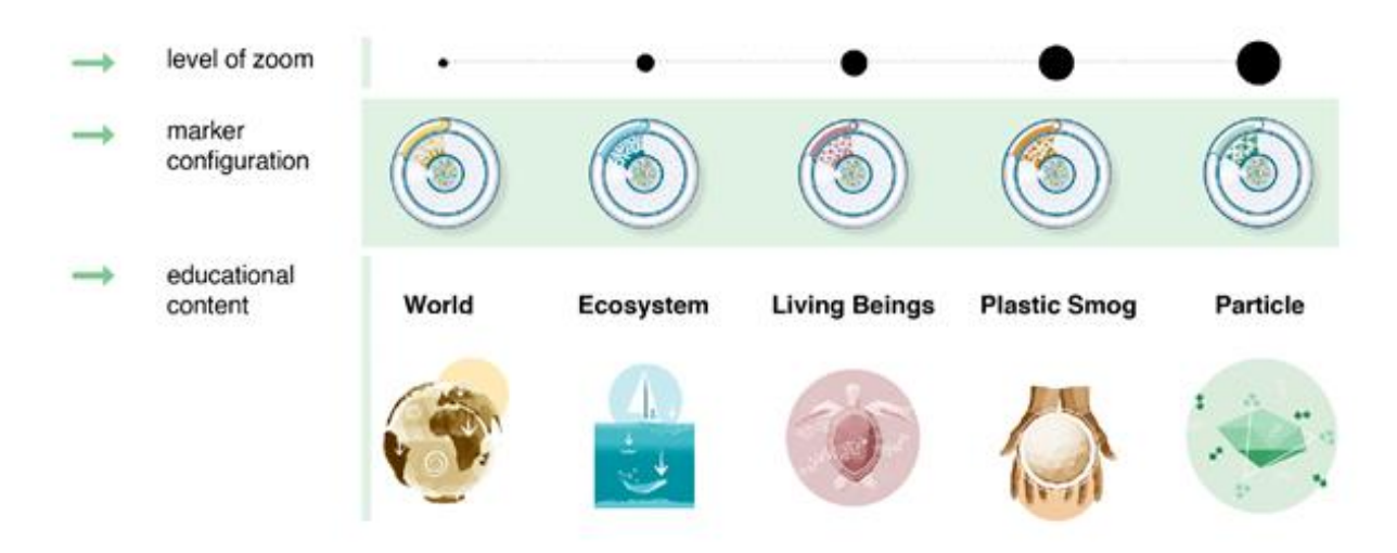
Figure 3. Correspondence between the five marker configurations and the educational content of the application.

The AR application, developed by using the Unity software (unity.com) and the Vuforia Engine (https://developer.vuforia.com/), is composed of two main sections. The first is an introductory section, divided into the Welcome Page, the Tutorial and the Index of the content. The second section is where the interactive learning experience takes place. It is represented by one single scene, the Main Scene, in which the user is asked to frame the marker to trigger the AR interactive content. From the Main Scene, the user is able to access five different sections of the learning experience, through the recognition of the corresponding marker configuration (Figure 3).