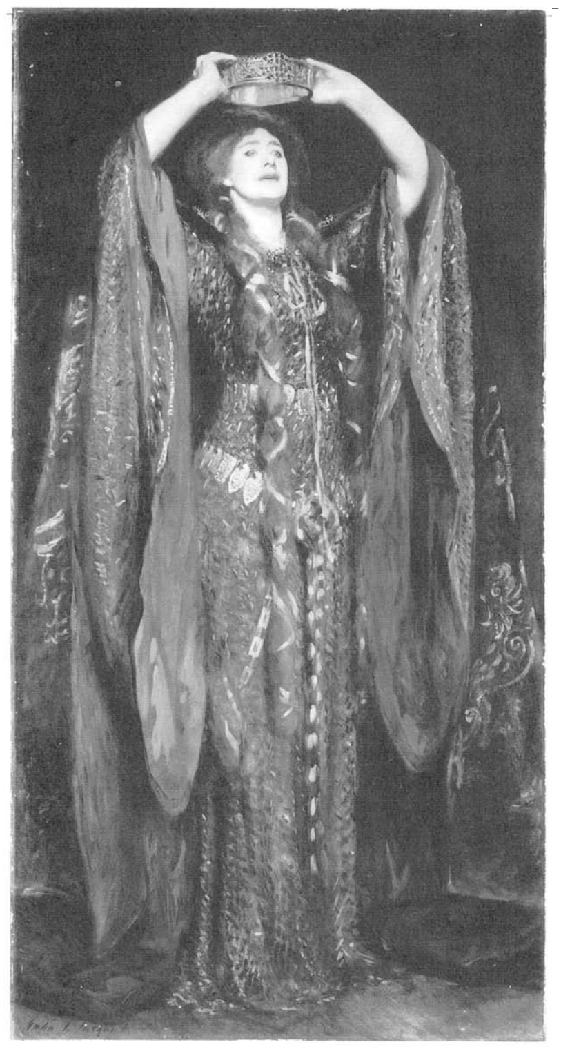
ELLEN TERRY AS LADY MACBETH (1889) by John Singer Sargent

( National Portrait Gallery , on loan from the Tate Gallery ) https://doi.org/10.1017/S0307883300005769 Published online by Cambridge University Press