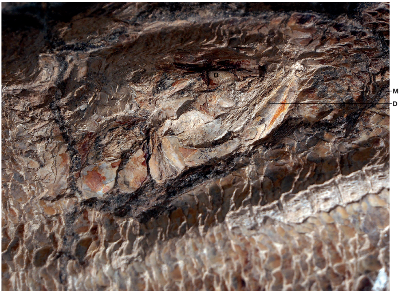
Fig. 2. Calamopleurus cylindricus Agassiz, 1841, ND 2013.01. Detail of the skull of the swallowed prey (see Fig. 1); O – orbit, M – median gular plate; D – dentary.

ND 2013.01 is the first record of C. cylindricus with a smaller-sized conspecific individual as prey item. This shows that Calamopleurus did not exclusively feed on Vinctifer . This raises the question why C. cylindricus would express cannibalistic behaviour to a certain extent? Juanes (2003) studied such