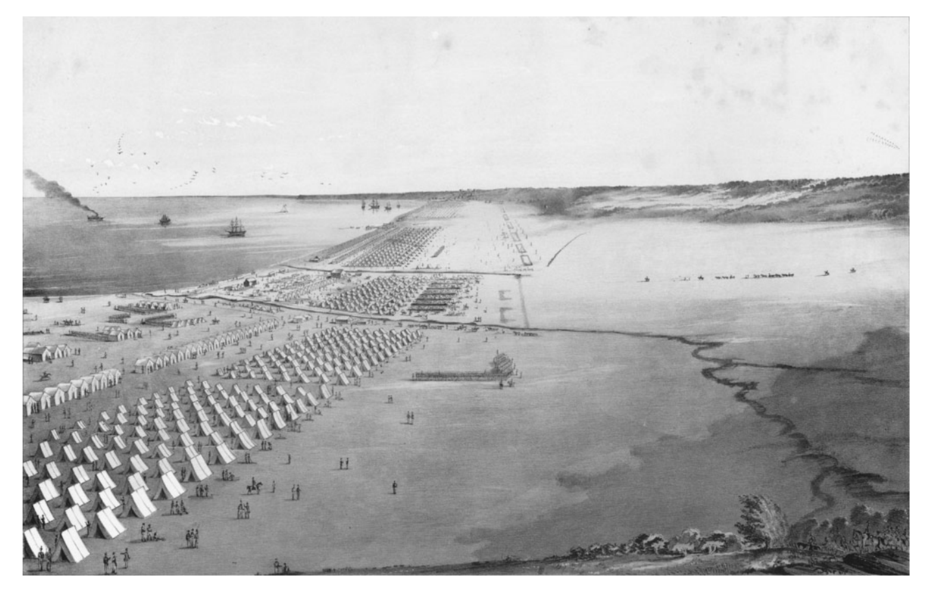
Figure 1. Daniel Powers Whiting's 1847 lithograph "A Bird's-Eye View of the Camp of the Army of Occupation" gives a sense of the enormity of Camp Marcy, but does not indicate how the depicted buildings were used. Public domain.