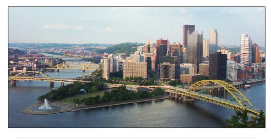
View of "the Point" and downtown Pittsburgh, Pennsylvania, from Mt. Washington.

Before steel production, the United States depended on Pittsburgh for glass. At one time, 62 glass factories decorated