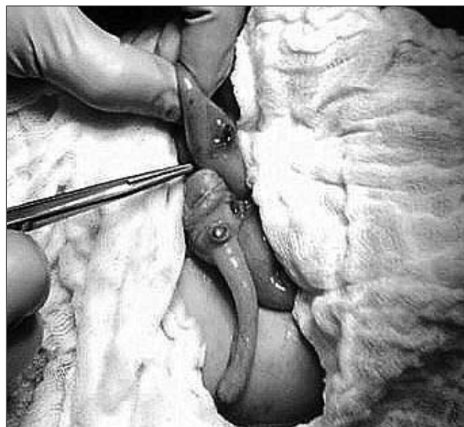
Fig. 2. Intraoperative photo showing 1 perforation in the ileum and 1 near perforation at the base of the appendix.

without complications, a history of possible magnet ingestion should be treated more cautiously. Likely due to the popularity of magnetic toy sets, there have been numerous case reports in the last 5 years of serious complications including 1 death from the ingestion of multiple magnets. Complications occur when magnets in different bowel loops attract each other and trap bowel wall tissue between opposed surfaces. This can lead to bowel necrosis, perforation, volvulus and sepsis. 4,7 In reviewing the previous case reports, which all required surgical intervention, 4,7 it is not clear how often cases of multiple magnet ingestions require no intervention. We were unable to find any cases of these reported in the literature. However, the number of case reports documenting severe complications from single battery ingestion suggests that morbidity is not uncommon.