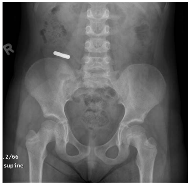
Fig. 1. Abdominal radiograph showing 2 magnets attached end to end in the lower right quadrant.

Although most foreign bodies that are ingested pass