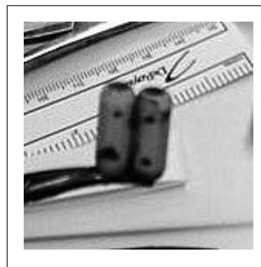
Fig. 3. Two magnets retrieved through one of the perforations.

In cases of suspected magnet ingestion, plain film radiography is a reasonable screening tool, as magnets are radio-opaque. If ingestion of a single magnet is