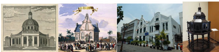
Figure 3. Changes of Wayang Museum building (From left) The church in the 17th century; the reconstructed building in the 18 th century; the current Wayang Museum; a scale model of the first building inside current museum