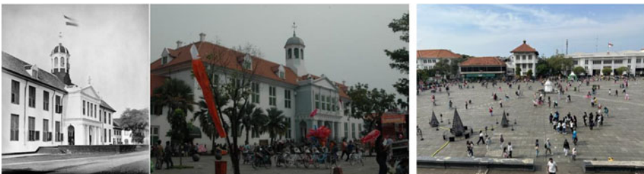
Figure 2. Fatahillah Square and surroundings Batavia City Hall between 1875 and 1885 (Left) Jakarta History Museum in 2016 (Middle) Panoramic view of Fatahillah Square in 2023 (Right)

Finally, the Wayang Museum [Figure 3] is a site where Wayang traditional puppets that originated in Java from various regions are now on display, and puppet shows are also held. The Wayang Museum was built as a church in the mid-17 th century and rebuilt in a new style in the early 18 th century after the