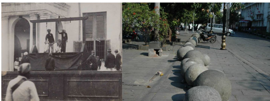
Figure 4. Fatahillah Square as a (post)colonial space Public execution as held in the colonial past (Left); Stones used to bind prisoners, now used to prohibit vehicle entry (Right)

building collapsed in an earthquake. The façade of the new building remains to this day. It continued to be used as a church and then as a warehouse for a trading company. In 1939, when the Dutch colonial period was almost over, it was used to exhibit the history of the city of Batavia. After independence, the building opened as the Wayang Museum in 1975.