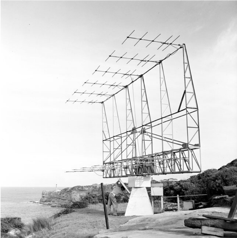
Figure 2. A 12-element Yagi antenna installed on the cliff top at Dover Heights and mounted on the turntable of a WWII radar. The antenna had a 12 degree beam and was used in 1951–1953, at a frequency of 100 MHz, to carry out a survey for discrete radio sources. One hundred and four sources were detected in this survey. In 2003, a full sized-replica of one of the early Yagi antennas was installed on the cliff top at Dover Heights as a memorial to the site.

The postwar successes established radio astronomy as a rapidly growing area of astronomy research. Sullivan (2009a) has noted that the first known usage of the term ‘radio astronomy’ in the West, occurs in a letter by Joseph Pawsey written in January 1948. In August 1948 the new Commission for ‘Radio Astronomy’ was established by the IAU. Within a year the term radio astronomy was in common use.