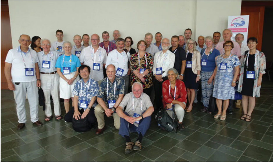
Figure 3. Participants at the joint IAU C40 / IUCAF Business meeting. Held at IAU General Assembly XXIX on 6 August 2015.

( d ) to encourage astronomers, particularly those in countries that fall under Resolves 3, to work proactively in protecting radio astronomy observations in the frequency range 76–81 GHz.