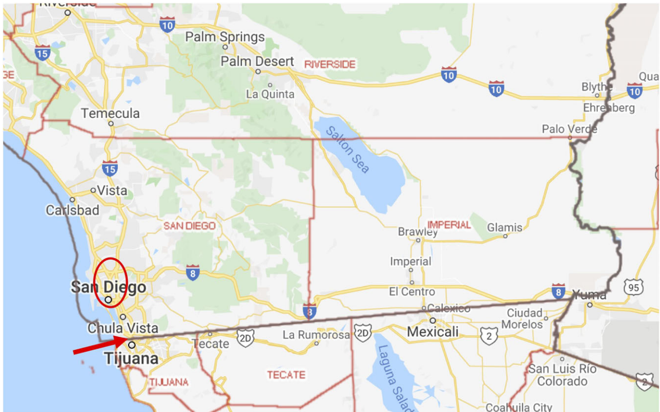
Figure 1. Southern California and Baja California, Mexico. San Diego and Imperial counties located in Southern California, bordering the state of Baja California, Mexico. The city of San Diego borders Tijuana, Mexico while the city of El Centro, California borders Mexicali, Mexico. Arrow, San Ysidro Land Port of Entry. Circle, the location of the 4 ECMO centers (3 adult, 1 pediatric) in San Diego County. Map created by Google Maps, Alphabet Inc, Mountain View, California.

reviewed the data daily and met on a regular basis to discuss management of regional health-care capacity, including an assessment of current status and an evaluation of potential emerging shortages. If an increasing trend of San Diego ECMO resource use were to be detected, then steps would be taken to assist the centers to build capacity. This would include requesting additional staffing resources or equipment from surrounding counties or the California Department of Public Health.