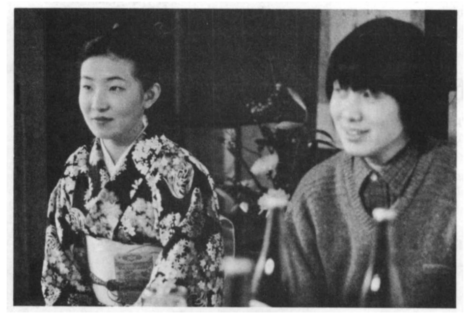
Six new films to celebrate The UN World Communications Year for 1983

There is nothing simple about the Japanese. The obvious answers to questions about their current success as a society have all been given.