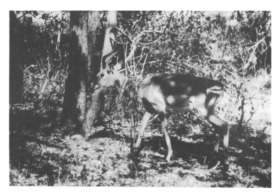
Impala buck (Bob Webzell).

with its dramatic tumbling display. The piercing cries of fish eagles were music to our ears, but invoked alarm in colonies of nesting birds.