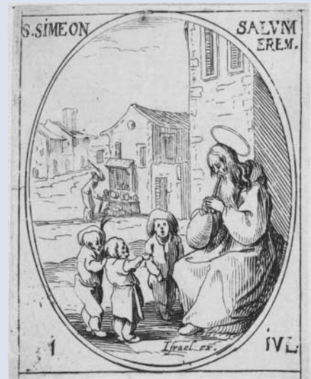
Jacques Callot, Saint Simeon Salus, 17th century.

The life of Symeon contains common features with traditional hagiographical literature with the purpose of showing that the saint was an imitator of Christ. Thus, Symeon gives food to the poor, practises exorcisms and saves people from sins. Nonetheless, he had erratic behaviours unparalleled in other anchorites that constantly provoked public scandals: he ate copiously in taverns, defecated in the streets, practised nudism, entered the baths of women, pretended to rape a woman and walked around being carried and whipped by prostitutes in a sadomasochistic manner. The behaviours described in the life of Symeon could be compatible with severe mental illness, but his reputation made him turn the patron of the mentally ill, whose festivity is celebrated on 1 July. Probably due to the eccentricity of Symeon Salus, there is not an iconographical tradition of him and therefore no devotional images. Calendars are probably the only visual source for Symeon Salus. A 17th-century French calendar illustrates the festivity of 1 July with a beautiful etching by the artist Jacques Callot that lyrically depicts Symeon in the city of Emesa surrounded by children.