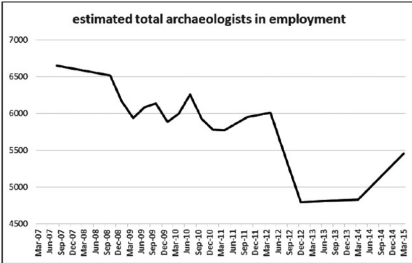
Figure 1 Estimated total archaeologists in employment in England (March 2007–March 2015). Aitchison (2015, 16).