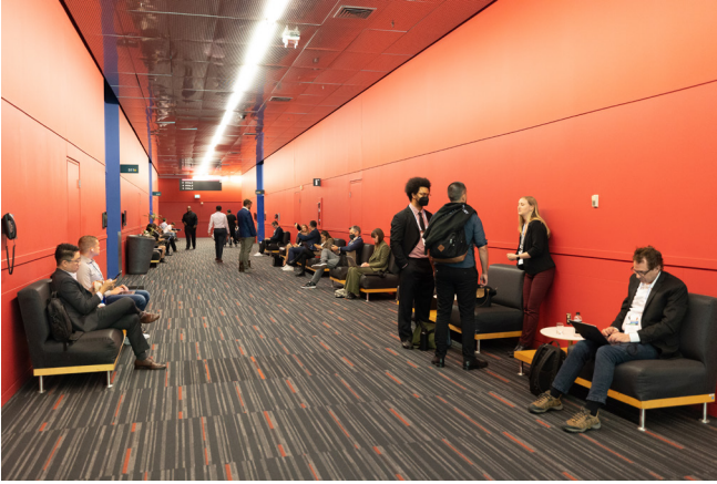
Attendees of the 2022 APSA Annual Meeting gather in Montreal's Palais Convention Center.