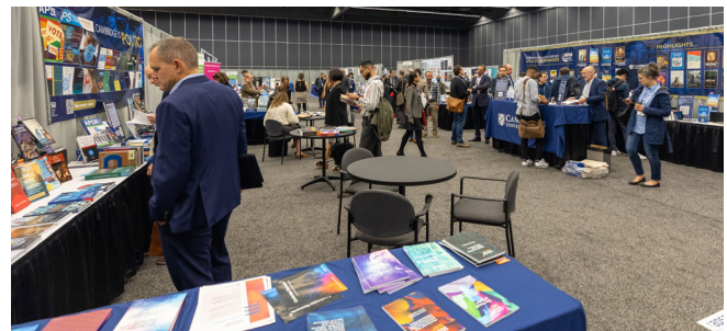
Top left: attendees of the 2022 APSA Annual Meeting speak at the Palais Convention Center. Top right: attendees visit the Exhibit Hall in the Palais Convention Center. Bottom left: attendees speak to poster presenters about their presentations. Bottom right: colorful windows cast rainbow reflections over an escalator in the Palais Convention Center.