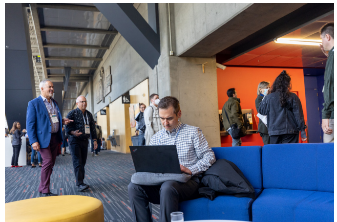
Attendees of the 2022 APSA Annual Meeting gather in Montreal's Palais Convention Center.

On Wednesday, nearly 30 in-person pre-conference short courses were held. Short courses provide diverse opportunities for professional development. In the evening, the Awards Ceremony took place both in-person and virtually, with the session livestreamed to the virtual platform for all attendees. Congratulations to the 2022 APSA Award winners ( https://political-scienenow.com/2022-apsa-award-winners-announced/ )!