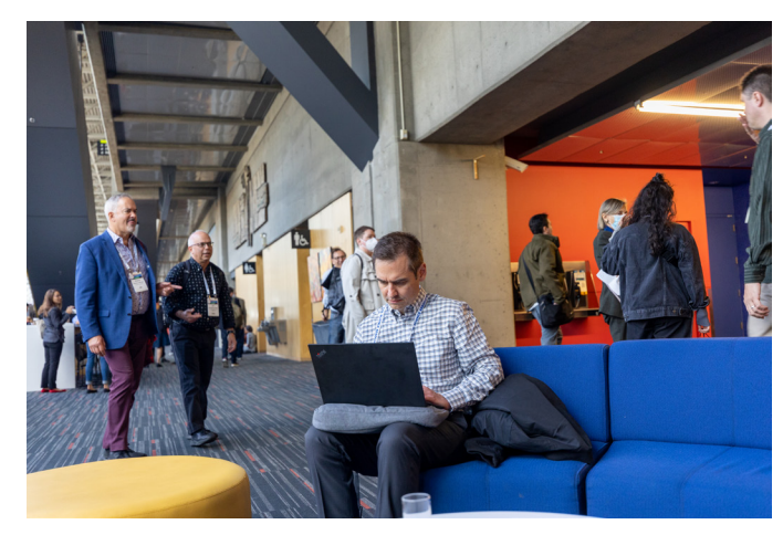
Attendees of the 2022 APSA Annual Meeting gather in Montreal's Palais Convention Center.

On Wednesday, nearly 30 in-person pre-conference short courses were held. Short courses provide diverse opportunities for professional development. In the evening, the Awards Ceremony took place both in-person and virtually, with the session livestreamed to the virtual platform for all attendees. Congratulations to the 2022 APSA Award winners (<a href="https://political-sciencenow.com/2022-apsa-award-winners-announced/">https://political-sciencenow.com/2022-apsa-award-winners-announced/</a>)!