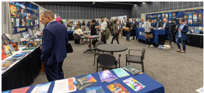
Top left: attendees of the 2022 APSA Annual Meeting speak at the Palais Convention Center. Top right: attendees visit the Exhibit Hall in the Palais Convention Center. Bottom left: atendees speak to iposter presenters about their presentations. Bottom right: colorful windows cast rainbow reflections over an escalator in the Palais Convention Center.