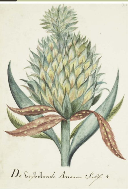
Pencil drawing of a pineapple, ca. 1763. By Cornelis Markée, based on Maria Sybilla Merian's Metamorphosis Insectorum Surinamensium (1705).

For further information: www.itinerario.nl