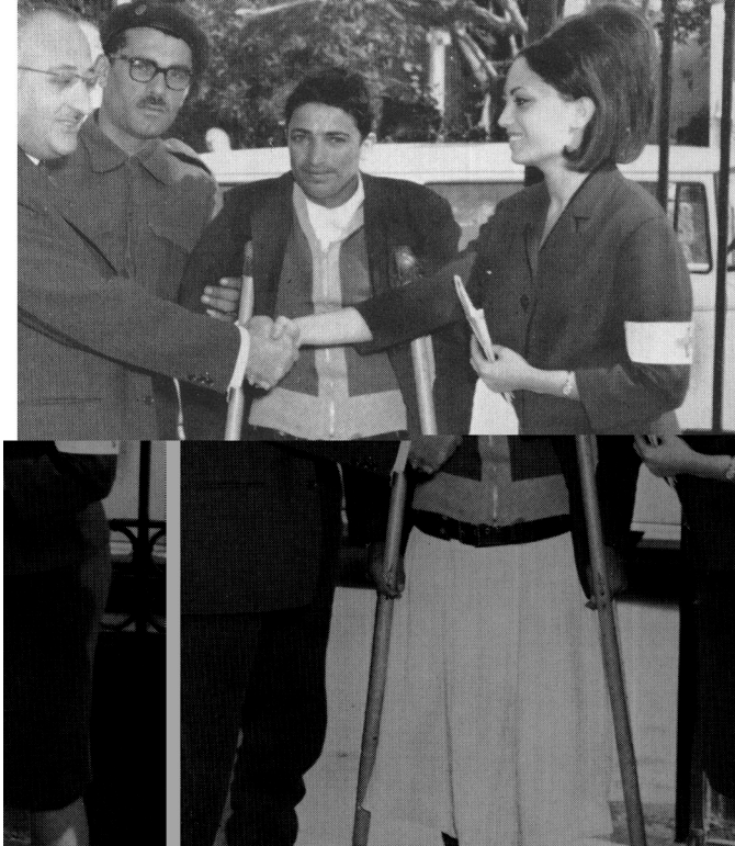
One of the Yemeni war disabled being received by the Lebanese Red Cross...