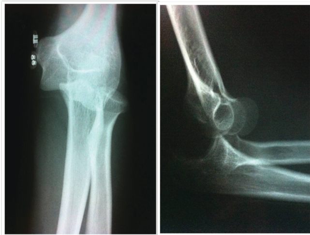
Figure 1. Anteroposterior and lateral radiographs demonstrating posterior elbow dislocation.