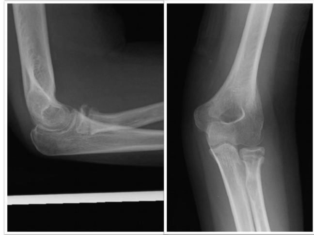
Figure 3. Radiographs of the elbow at 6 weeks from open reduction.

medial aspect of the joint, often in the form of an avulsed medial epicondyle. The uncommon second type results from a temporary posterior subluxation or dislocation of the elbow joint. The radius neck is fractured at the time of spontaneous reduction when the radius impacts against the posterior aspect of the capitellum. The mechanism of injury in our patient is similar to that of the second type described by Jeffery.