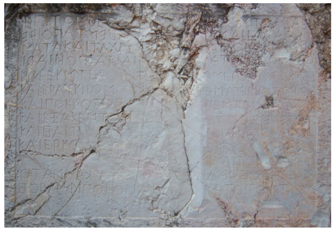
Fig. 2. Current condition of inscription.