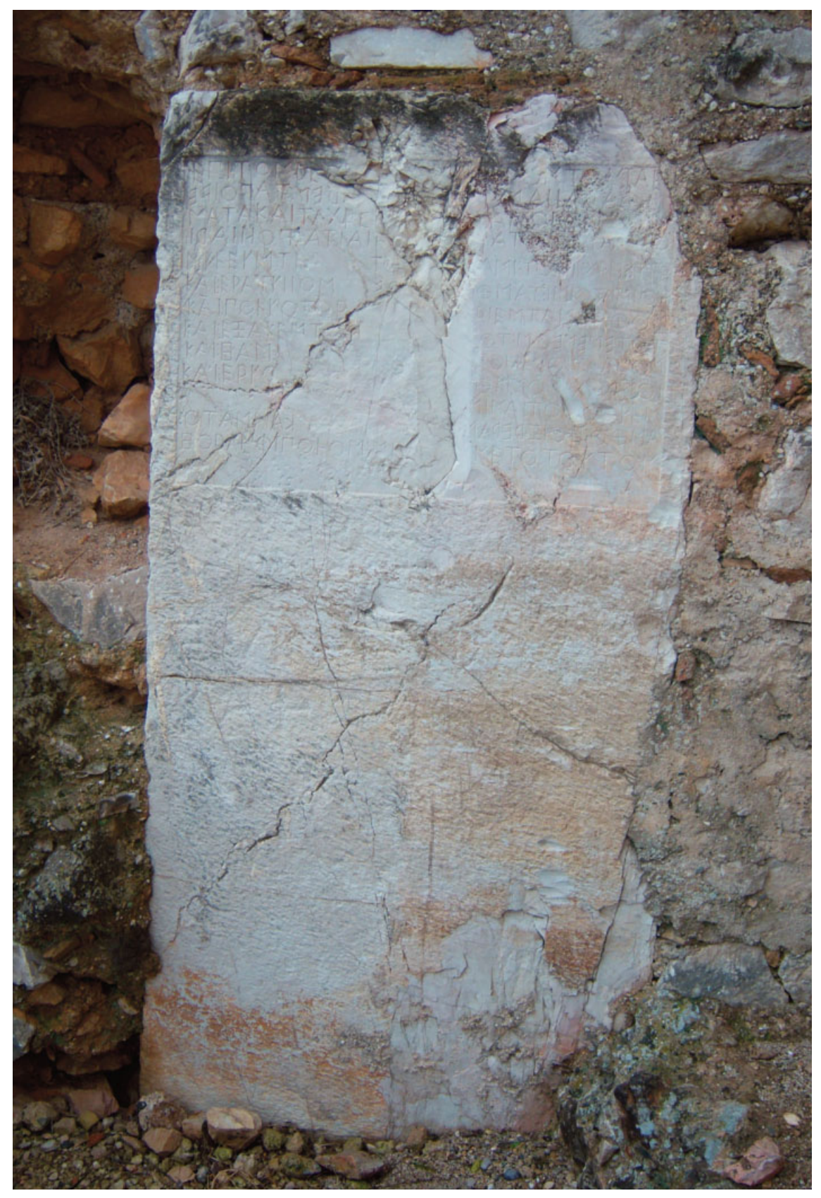
Fig. 1. Inscription in situ.