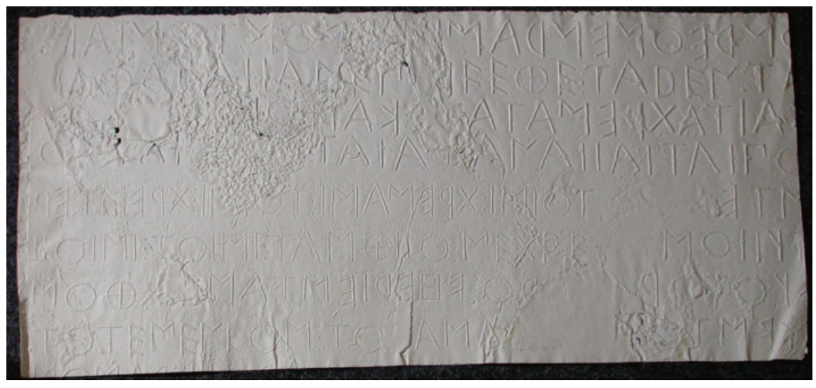
Fig. 3. Smaller Berlin squeeze (photograph courtesy of the Berlin-Brandenburgische Akademie der Wissenschaften, Archiv der Inscriptiones Graecae).

unpublished materials in the Anne Jeffery Archive of the Centre for the Study of Ancient Documents in Oxford.<sup>13</sup> At the same time, we take the opportunity to make a new proposal about the grammar and meaning of the final lines of the inscription, which have been interpreted in a wide variety of different ways.