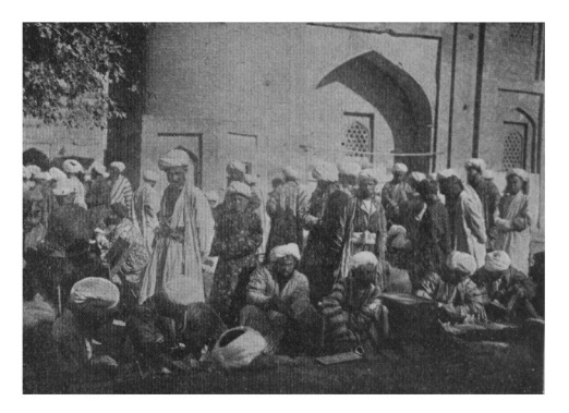
8. In a Market Place at Bokhara.