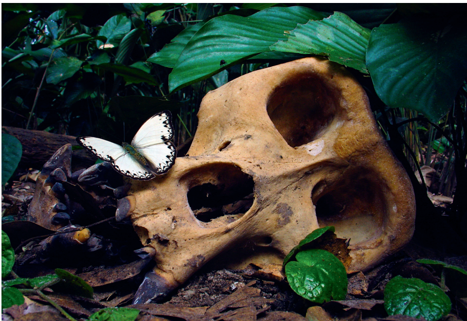
Photo: Some conservation policies implicitly treat individual animals as irrelevant or expendable, while some frame them only in terms of their contribution to the species overall or to other conservation goals. Skull of a western lowland gorilla.

There are many ways to include animals in ethical decision-making. One way is to consider who or what matters morally, and