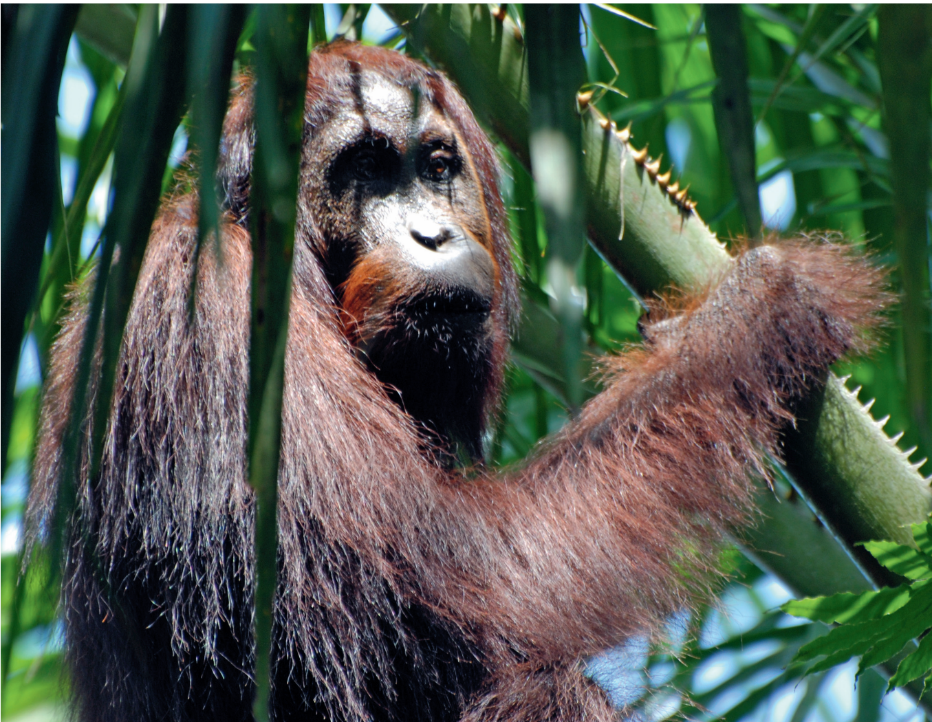
Photo: When species conservation goals conflict with the interests of human individuals and collectives, they can generate difficult moral dilemmas whose resolution requires careful consideration and respect. Orangutan in an oil palm plantation. © HUTAN-Kinabatangan Orang-utan Conservation Project

of interspecies interdependence, attuned to the flourishing of both humans and animals as members of their ecological communities (Batavia et al. , 2021; Kirby, Steindl and Doty, 2017; Nieuwland, 2020).