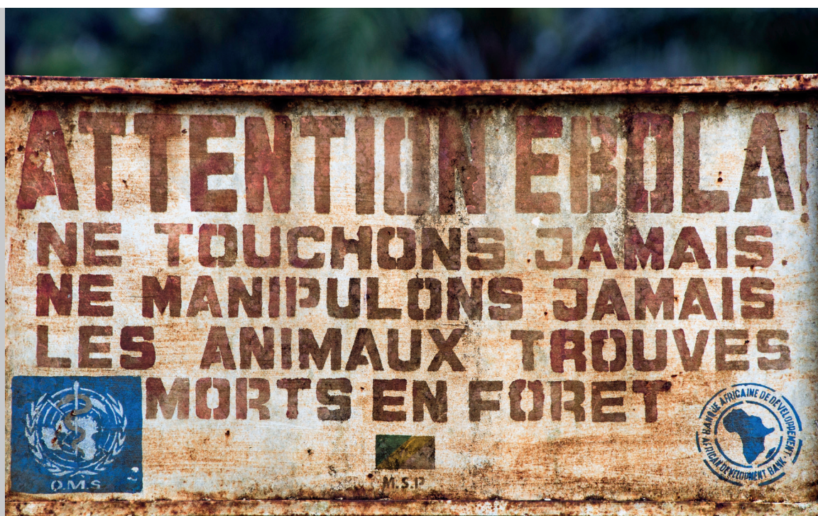
Photo: Is it justifiable to spend significant resources on a potentially unachievable goal of protecting apes against Ebola virus disease (or another threat to their health) in situ while the health needs of neighboring human communities remain unmet due to a lack of funds?

60 mountain gorillas ( Gorilla beringei beringei ) to protect them against what they presumed was measles, although the diagnosis remained unconfirmed (Cranfield and Minnis, 2007).