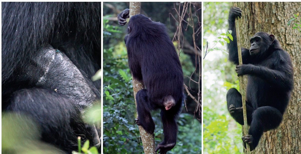
Special two months after intervention (left and middle) and gripping a branch three months after intervention (right).