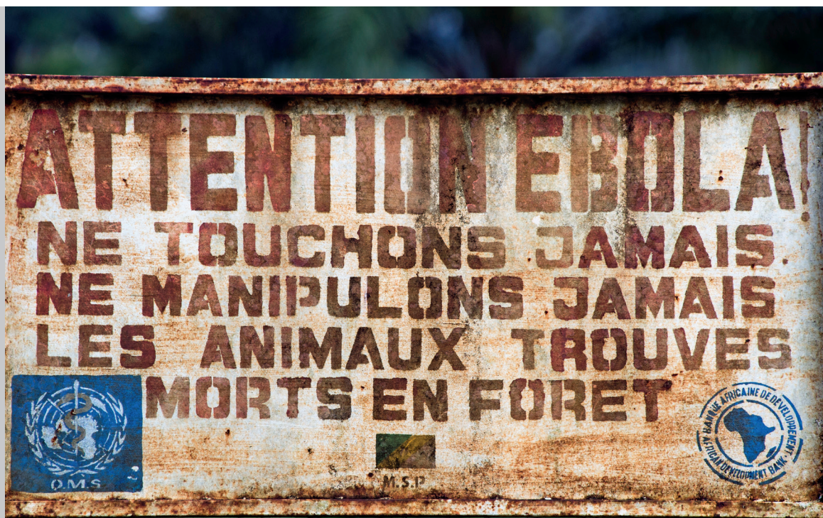
Photo: Is it justifiable to spend significant resources on a potentially unachievable goal of protecting apes against Ebola virus disease (or another threat to their health) in situ while the health needs of neighboring human communities remain unmet due to a lack of funds?

60 mountain gorillas ( Gorilla beringei beringei ) to protect them against what they presumed was measles, although the diagnosis remained unconfirmed (Cranfield and Minnis, 2007).