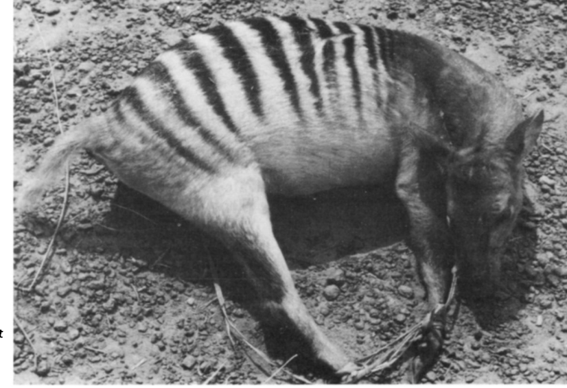
Banded duikers are frequently sold for meat at the roadside.

For the wildlife the situation is alarming. Until recently hunting was uncontrolled — 'anyone kills anything, anytime, anyhow, any place...'. Guns are sold freely — more than 13,000 were sold officially in 1977, and there must now be more than 100,000 in the country, one for every 12 inhabitants; in some regions every family possesses at least one and sometimes several. The demand for ammunition is such that a local cartridge factory has been set up. No game survives within 10 km of the main highways, and as the country is more or less criss-crossed with roads, undisturbed places are rare. Game is sold openly, everywhere. All birds are killed, including birds of prey and carrion feeders, except sparrows (not worth a cartridge) and cattle egrets Bubulcus ibis (protected by taboo). Night hunting using vehicle headlights enormously increases the hunters' destructive capacity.