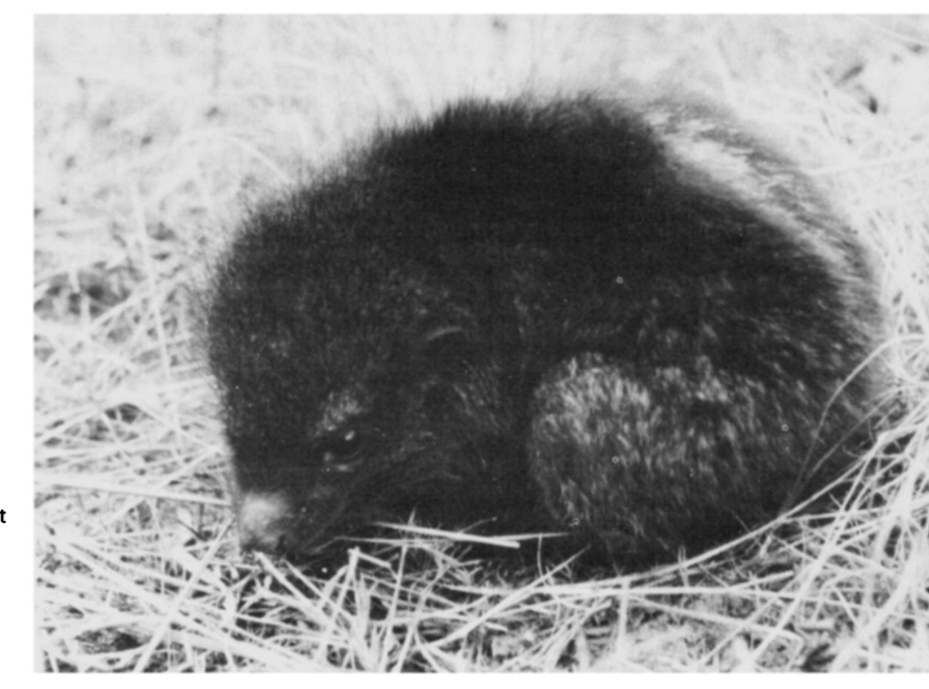
Tree hyraxes are difficult to hunt and are seldom eaten.

For the wildlife the situation is alarming. Until recently hunting was uncontrolled — 'anyone kills anything, anytime, anyhow, any place...'. Guns are sold freely — more than 13,000 were sold officially in 1977, and there must now be more than 100,000 in the country, one for every 12 inhabitants; in some regions every family possesses at least one and sometimes several. The demand for ammunition is such that a local cartridge factory has been set up. No game survives within 10 km of the main highways, and as the country is more or less criss-crossed with roads, undisturbed places are rare. Game is sold openly, everywhere. All birds are killed, including birds of prey and carrion feeders, except sparrows (not worth a cartridge) and cattle egrets Bubulcus ibis (protected by taboo). Night hunting using vehicle headlights enormously increases the hunters' destructive capacity.