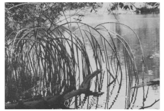
Mangroves, a habitat relatively little threatened in Liberia.

advice is available on the setting-up of the reserves. Scientific research and recording stations should be established as soon as possible.