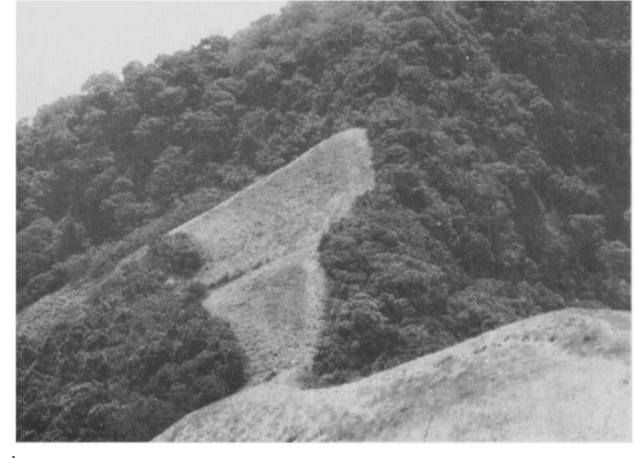
Mining has destroyed much of Mt Nimba but its high altitude grasslands on the Guinea side are safe — no mining will take place there.

High Mano forests is vital, for the headwaters of the future inter-state dam of Mano rise there.