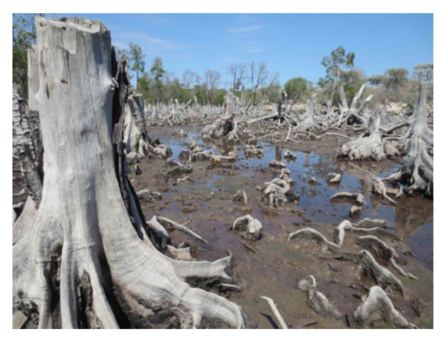
PLATE 3 Clear cutting of Rhizophora mucronata and Ceriops tagal in response to demand for lime in 2013.

differences between households in lime production and consumption, for example according to wealth and migration status. If migration into coastal villages continues, incomes rise, and demand for building timber and lime render grows, how can mangrove harvesting patterns and rates be managed in such a way as to allow mangrove regeneration?