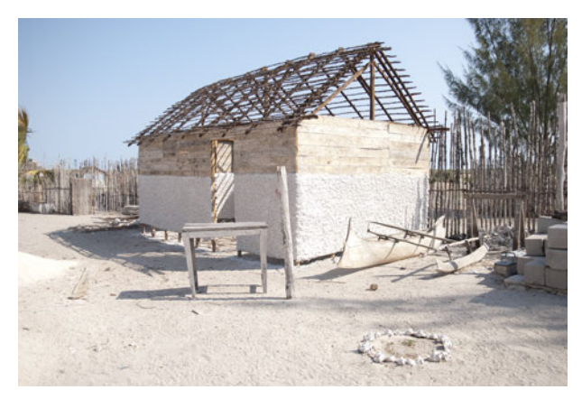
PLATE 1 A house wall with wooden frame and lime render.

Coastal areas in Madagascar are increasingly experiencing in-migration, as poor agricultural households move to the coast seeking more secure livelihoods (Bruggemann et al., 2012). Data are scarce, but there is evidence that the Bay of Assassins is experiencing significant in-migration. For example, in the villages of Lamboara and Ampasilava < 30% of inhabitants were born in those settlements (Epps, 2007). The region's arid climate and the growth in marketing opportunities for marine produce have encouraged people to turn from inland agriculture to coastal fishing