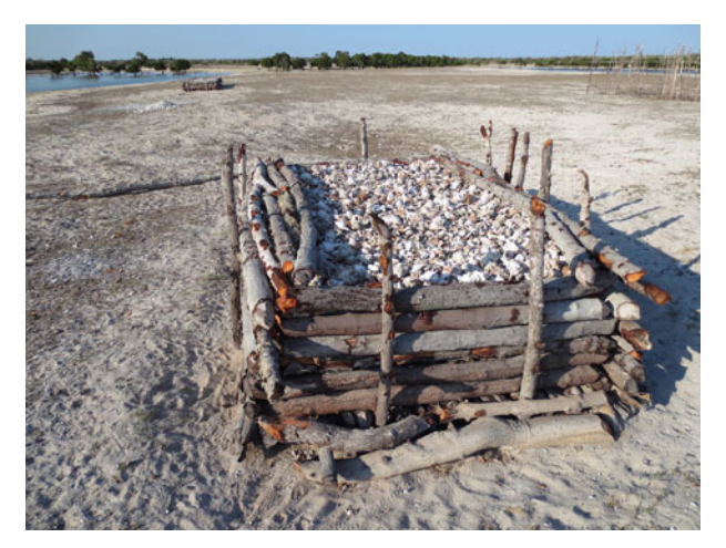
PLATE 2 A lime kiln in the Bay of Assassins.

Changes in lime production and use have important implications for mangroves. Our vegetation surveys show that