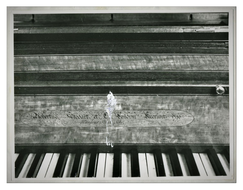
Figure 3a. Nameboard of Stodart pianoforte shown in Figure 1. (The white mark appears on the archival photograph, not on the instrument.)