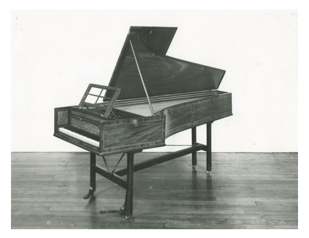
Figure 1. Pianoforte by Robert Stodart (London, 1790) in the Horniman Museum (M47-1982).

suggested by Chalmers's essay quoted above, it is quite feasible that this Stodart piano of '1799' was used for the 1934 festival. Incidentally, Beethoven worked on his first piano concerto between 1795 and 1800, and one cannot help speculating whether this may have been an additional factor in Arnold's decision to settle on 1799 as a possible date for the instrument.