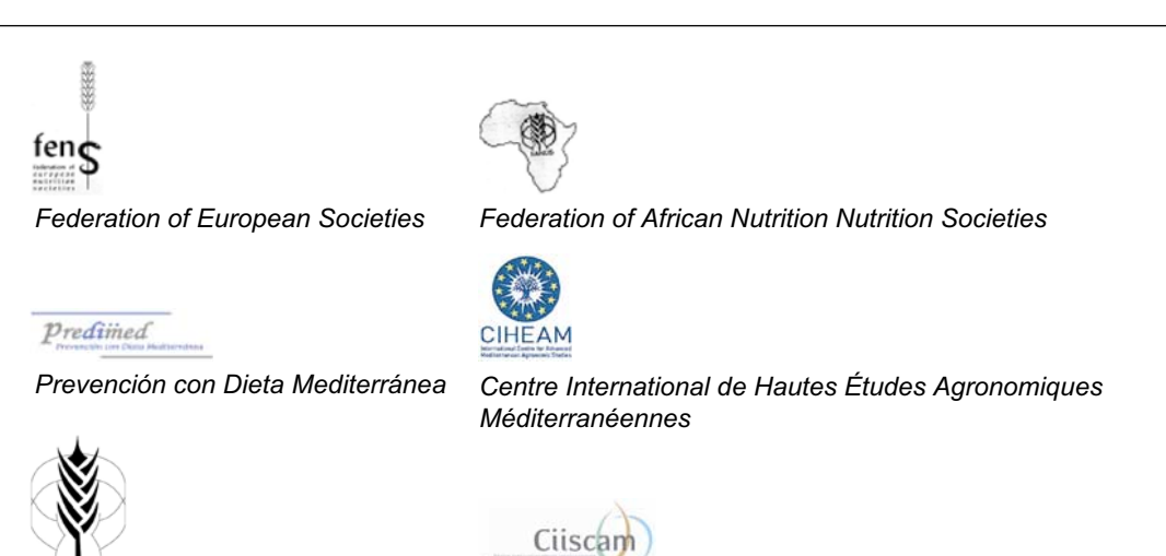
International Union of Nutritional Centro Interuniversitario Sciences Internazionales di Studi sulle Culture Alimentari Mediterranee