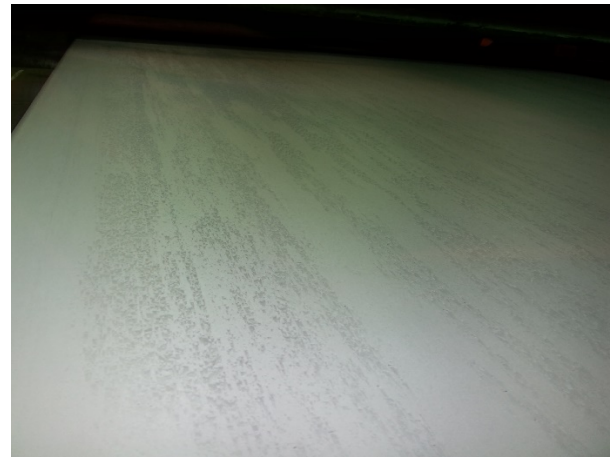
Figure 2. The surface of the hot rolled strip after the pickling process showing partially removed oxide scale.