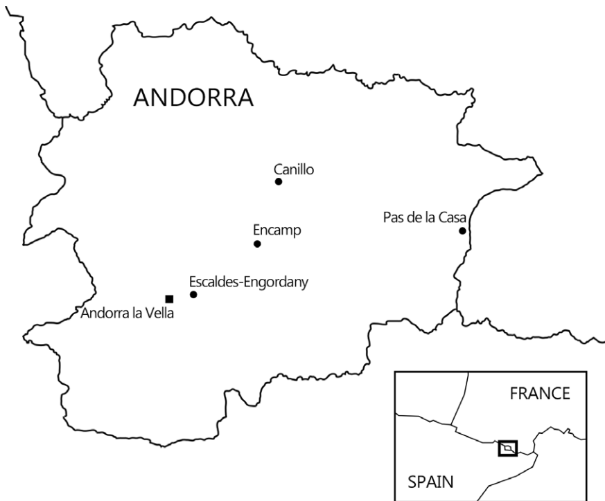
Figure 1. Map of Andorra.

prevailing attitudes and ideologies regarding French contribute to this complex situation, and what this can tell us about the future of French in Andorra.