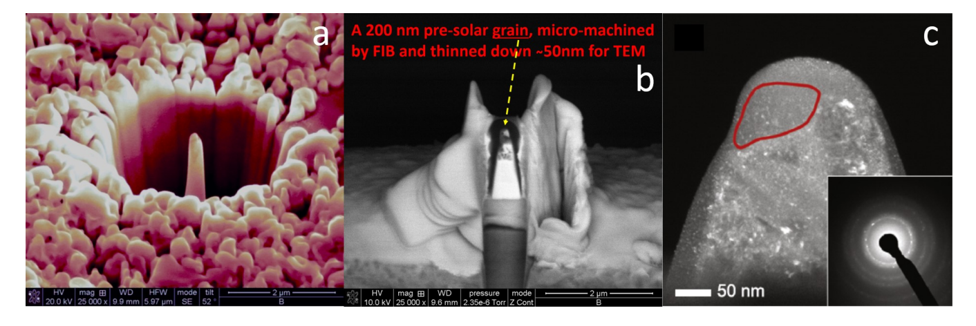
Figure 2. a) a sub-μm presolar grain is isolated from neighboring meteorite matrix grains by FIB milling for subsequent NanoSIMS isotopic analysis. b) an electron transparent section of the grain was then produced by FIB for mineralogical analysis by TEM. c) darkfield TEM image and diffraction pattern from the presolar grain [3].