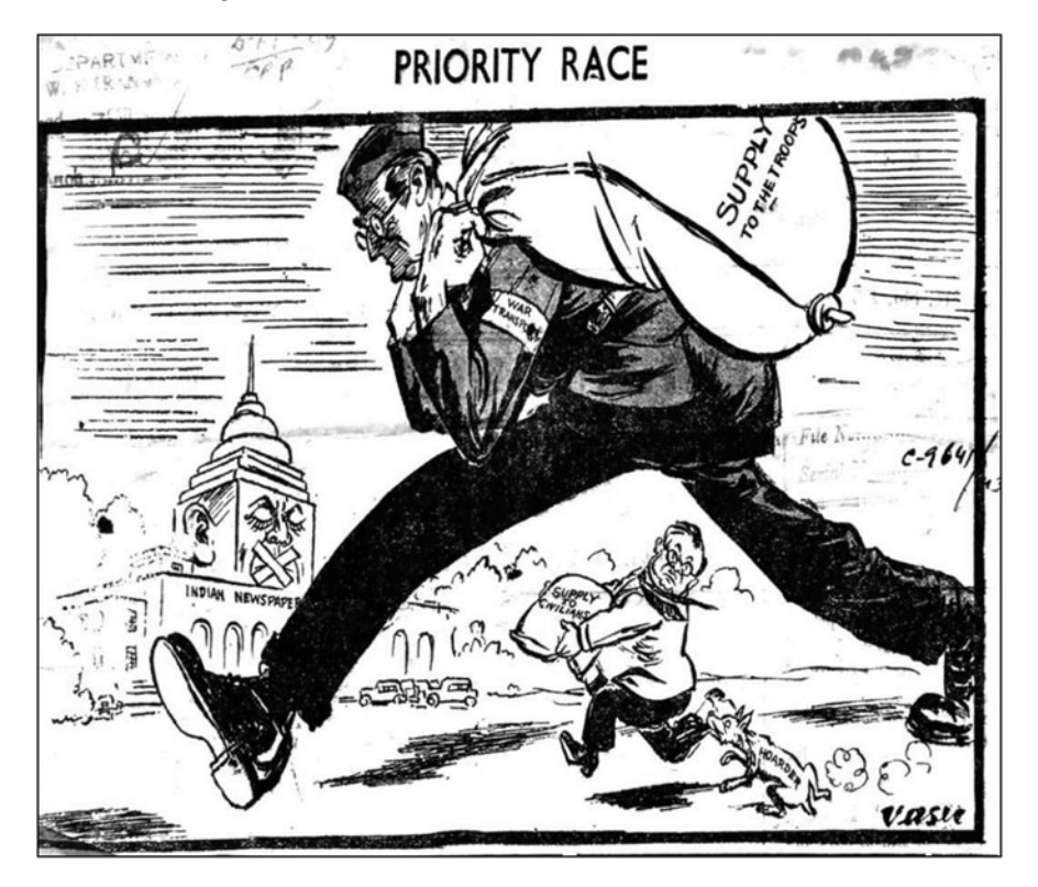
Figure 4. A contemporary newspaper cartoon depicting the discriminatory rationing practices of the colonial government.

Benthall Papers, Box no. 18, newspaper cuttings. Centre for South Asian Studies, Cambridge, UK.