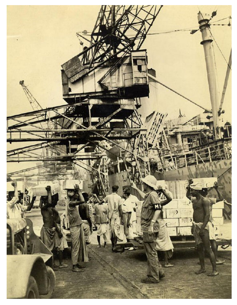
Figure 3. The photographer's caption: "GI dock workers of the port companies created order out of chaos at Calcutta's great docks, and thousands of tons of vital war supplies flowed through to China, Burma and India. The MP is on hand to see that the coolies do not pilfer from the rations they are carrying." Photographer: Clyde Waddell. Public domain. Available online at: https://commons.wikimedia.org/wiki/Category: Photographs_of_Calcutta_by_Clyde_Waddell#/media/File:Coolies_carry_rations_at_Calcutta_Docks_in_1945.jpg, accessed on 17 January 2020.