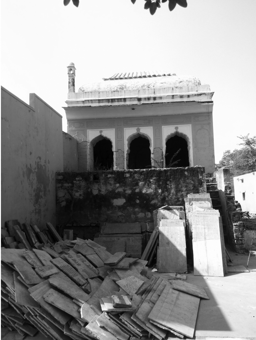
FIGURE 3.2 The decommissioned mosque at the Laldas shrine