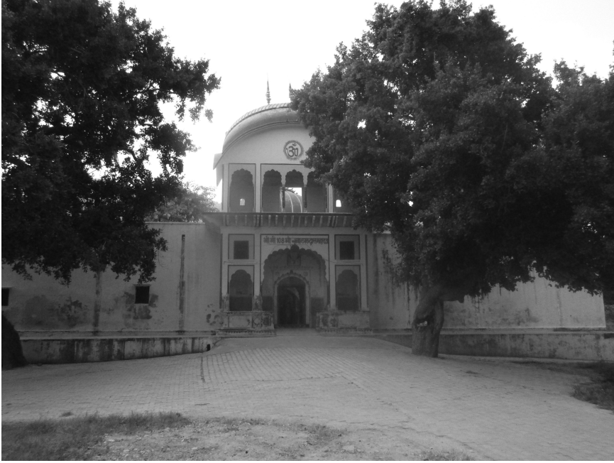
FIGURE 3.3 The Dholidoob shrine of Laldas, Alwar