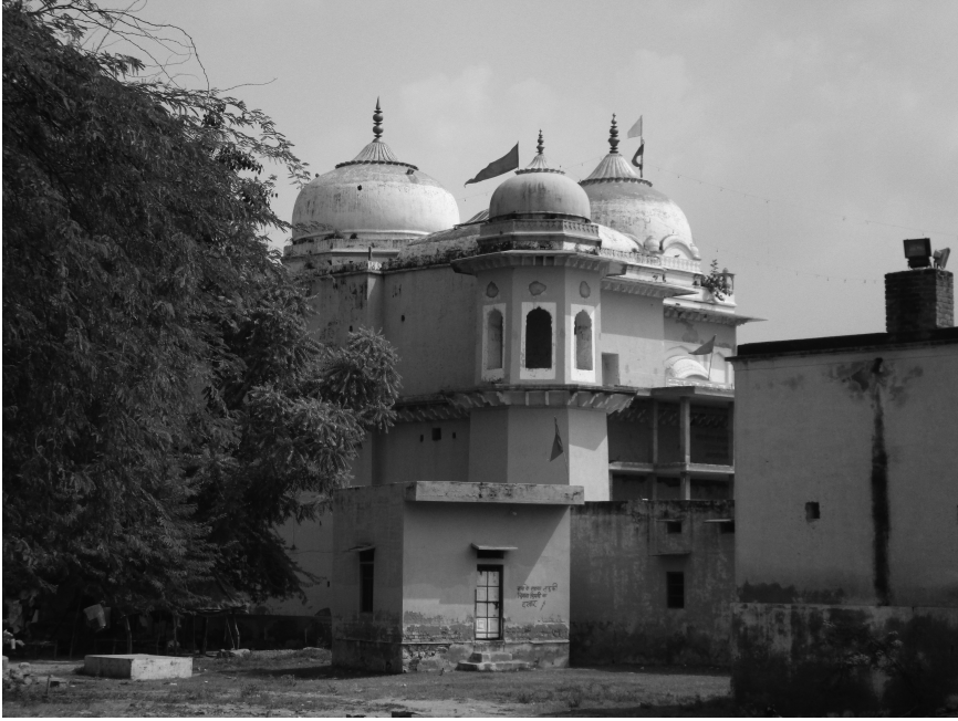
FIGURE 3.1 A side view of the Sherpur shrine