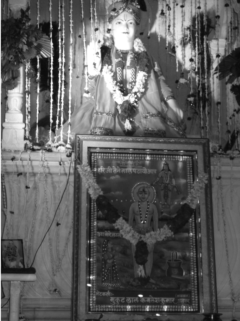
FIGURE 3.5 The deity Laldas in an anthropomorphic form for darśan