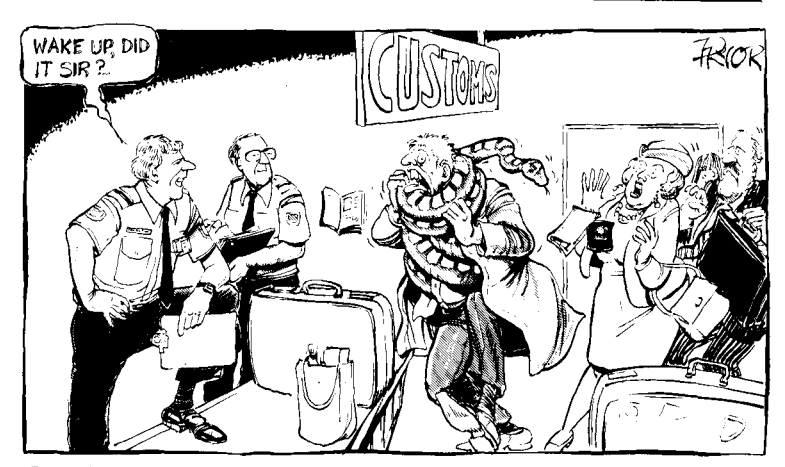
One of a series of postcards produced by the Australian National Parks and Wildlife Service in its campaign against illegal wildlife imports and exports. There are also posters, and leaflets in 17 languages.

Several species of cowrie shell occurring only in the waters of south-west Australia are believed to be under threat from over-collection. Although the Wildlife Protection Act places strict controls on the export of native cowries, they are apparently easily evaded by