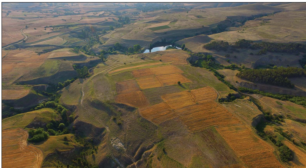
Figure 2. View of Vlaho from the east (after Naumov et al. 2021: fig. 2).

Initial survey indicated that Vlaho was a particularly large settlement for the Early Neolithic Balkans, with pottery scattered across approximately 6ha. This assessment was supported by a magnetic survey of 4.5ha of the terrace that revealed the presence of 13 semi-circular ditches—an unusually high number for Balkan and European prehistoric sites (Figure 3). While enclosures are a typical phenomenon for the Neolithic, and many settlements have similar circular ditches, these generally number between one and seven (Harding et al. 2006). In the case of Vlaho, there are up to 13 ditches in the southern part of the settlement, with some smaller ditches joined with or penetrated by larger ones. Furthermore, a large, quadrangular, double-ditched enclosure is present within the same area; however, it cannot be determined at present whether this was constructed before or after the excavation of the semi-circular ditches. To the north of this enclosure there is a further large, circular ditch. This makes Vlaho unique, displaying a complex system of ditches that enclose either a settlement or another form of symbolic or economic setting.