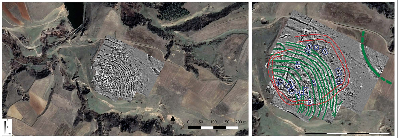
Figure 3. Results of magnetic scanning, with anomalies related to ditches highlighted (figure by M. Przybyła and G. Naumov).