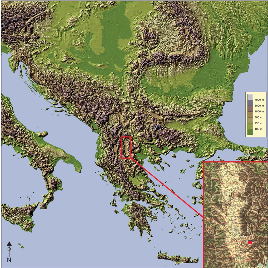
Figure 1. Map of the Balkans, indicating the location of Pelagonia and the site of Vlaho (inset) (map from www.treehousemap.com , amended by G. Naumov).