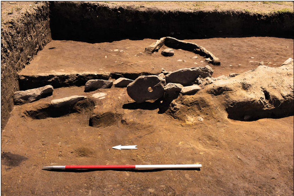
Figure 6. Structure with laterally set large grindstones in Trench 5.

Although small in scale, the excavation of Vlaho has provided information about the community inhabiting this Early Neolithic settlement (Naumov et al. 2021). Their buildings were constructed of unfired daub, with posts used to outline and reinforce them, while hearths were dug into the sandstone bedrock. Another large structure, located in Trench 5, comprised walls formed by large, laterally inserted grindstones (Figure 6). A complete fine clay vessel was positioned upside down within this structure, alongside a large cattle