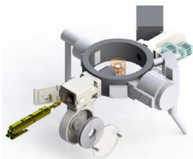
Figure 1. Section view of GridStage™ reel-to-reel sample handling system and high speed rastering cartridge installed on JEOL 1200EX microscope column. The exploded view shows a reel. Tape advances from the feed reel (left) to the takeup reel (right).