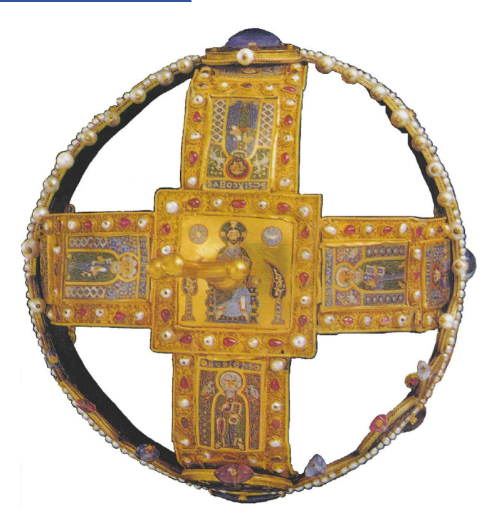
FIGURE 3 The Holy Crown of St. Stephen seen from the top, with the Latin inscriptions visible. From: https://tinyurl.com/4v45wafh.

have been still trying to appeal to both sides. The object itself provides evidence that it straddles two religious and political traditions, a multi-confessional biography that was continued in the mid-17th century, when, as the Habsburg Counter-Reformation attempted to purge Protestantism from its empire in general and Hungary in particular, an agreement was reached to ensure that the Crown Guard would always include both Protestants and Catholics (Bak & Pálffy, 2020, p. 170). At least twice in its history, then, the Crown has bridged religious divides rather than assert one side against another in religious wars.