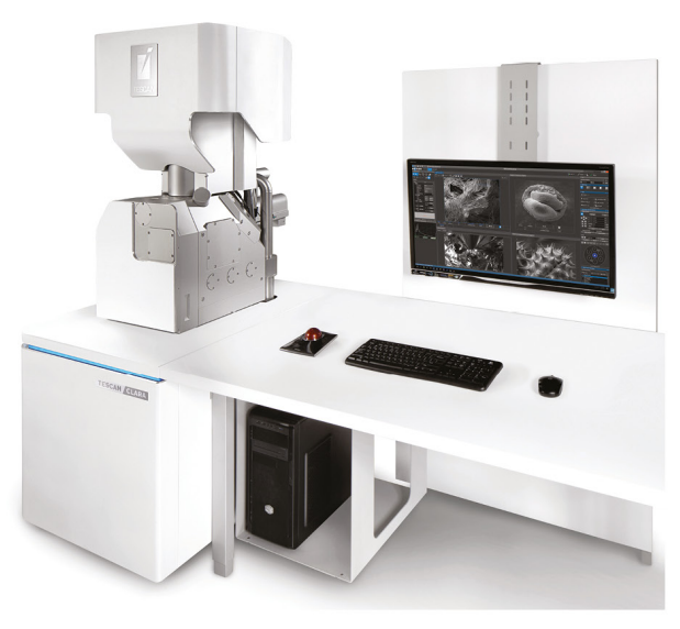
For more information visit