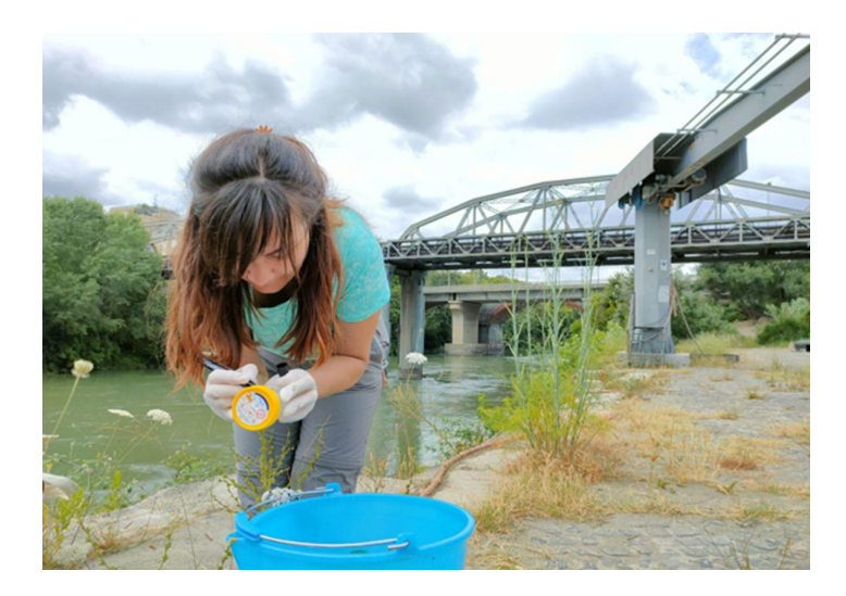
Figure 5: Labelling samples to be sent to laboratory, near Ponte di Ferro, south-central region of Rome.

explored each month not only the most common access points to the Tiber and Aniene such as the central segments reachable by bike path, but also those where access is more difficult (eg being possible only by passing through occupied lands or by cutting through vegetation with a sickle). Overall, this information asset fills existing gaps in scientific and public knowledge and could be of value both for scientists and for policymakers.