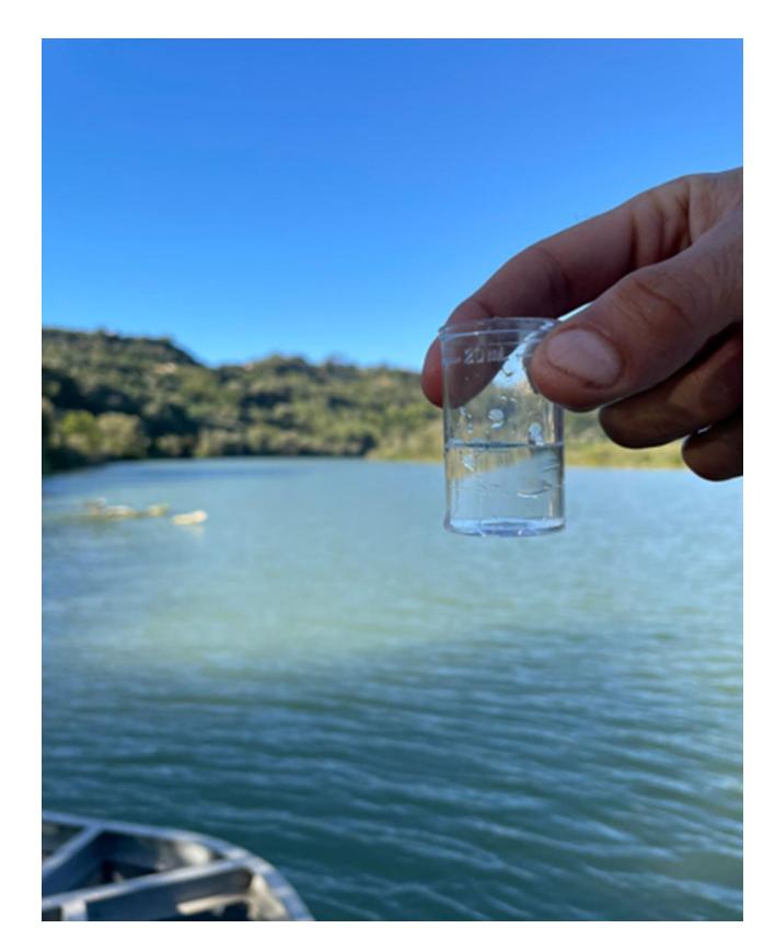
Figure 4: Water sampling for nitrate and phosphate in the southern part of Rome after the construction of the Acea purification plant.

would be truly polycentric and thus also would rely on the "collective intelligence" of local actors and caring communities, as in the studied cases.