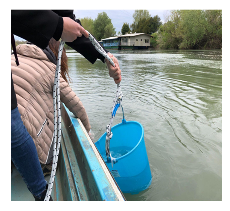
Figure 2: Water sampling in the southern part of Rome, close to the Acea purification plant.

the citizens, which is the more common pattern, as can be witnessed for citizen science projects in the health domain such as Genigma<sup>77</sup> and Stall Catchers<sup>78</sup>). The participants jointly decided that they wanted to estimate the diffuse pollution of the river's water, so the monitoring sites were chosen to characterise the entire urban stretch of Rome as homogeneously as possible. The only exception was the sampling point located in correspondence with the intake of the Grottarossa drinking water plant, which was identified in order to monitor the quality of water captured, purified and then fed into the water network for the drinking water supply. In total, eight monitoring sites were selected, all located within the Grande Raccordo Anulare (the ring road surrounding Rome). One of them was set at Ponte Salario on the Aniene in order to evaluate the contribution of this stream to the Tiber.