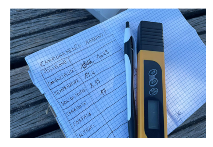
Figure 1: Instrument to monitor the temperature, conductivity and other parameters of water at a sampling point north of Rome.

pushed for the construction of other similar plants. Therefore, it appeared urgent to acquire some basic information about the river's water quality. Furthermore, participants were even more motivated due to the fact that during the year 2020 there were recurrent fish deaths in the Tiber. These were perceived as very anomalous events for a large river like the Tiber – demonstrating a high level of ecosystem degradation – and they increased the sense of distrust among the local citizens towards the institutional governance of the river.