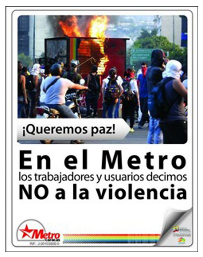
Figure 5: iQueremos paz! En el Metro los trabajadores y usarios decimos NO a la violencia. (We want peace! Workers and riders of the metro say NO to violence). http://www.vtv.gob.ve/articulos/2014/04/02/conactividades-culturales-y-entrega-de-volantes-trabajadores-metro-iniciaron-jornada-por-la-paz-4079.html.

siege mentality, a blocking off of a protected zone from a dangerous invasion or contagion.<sup>8</sup> The guarimbas extend a decades-long practice of erecting policed borders at the internal—racial and class—borders of the city. Protesters sought to destabilize the government, but in actions such as burning dark-skinned and redshirted effigies at their barricades, they also betrayed a more crassly racist motivation to their desires to interrupt ongoing social reforms (Ciccariello-Maher 2007, 2014a, 2014b; Tinker Salas 2014).