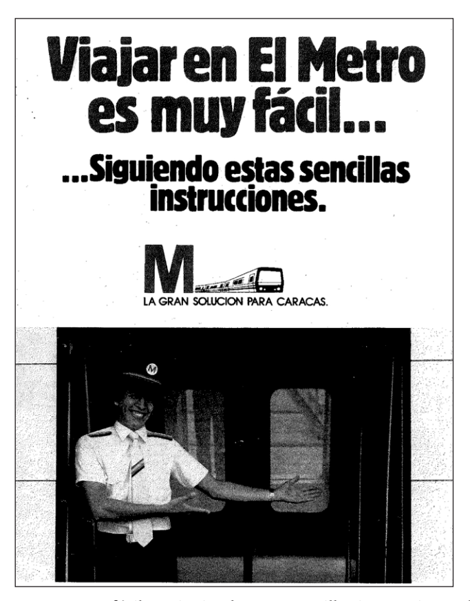
Figure 1: Viajar en El Metro es muy fácil ... siguiendo estas sencillas instrucciones. (It's very easy to travel on the Metro ... following these simple instructions). (Metro de Caracas n.d.).

In the two years immediately preceding its opening in 1983, a massive campaign—La Gran Solución para Caracas (The Grand Solution for Caracas; see Figures 1–3 )—sought to train residents for what planners