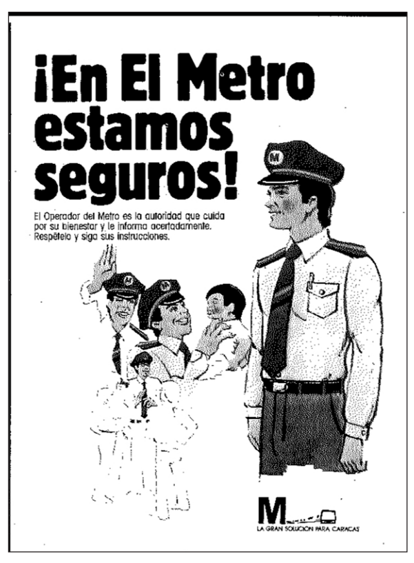
Figure 2: iEn El Metro estamos seguros! El Operador del Metro es la autoridad que cuida por su bienestar y le informa acertadamente. Respételo y siga sus instrucciones. (We're safe on the Metro! The Metro's conductor is an authority that cares for your well-being and wisely guides you. Respect him, and follow his instructions). (Metro de Caracas, n.d.).