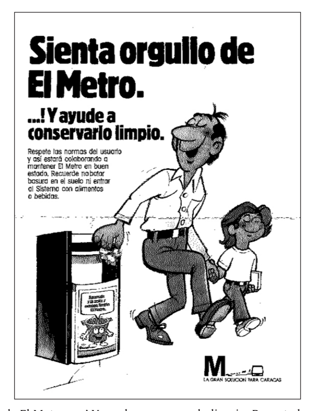
Figure 3: Sienta orgullo de El Metro ...! Y ayude a conservarlo limpio: Respete las normas del usuario y así estará colaborando a mantener El Metro en buen estado. Recuerde no botar basura en el suelo ni entrar al Sistema con alimentos o bebidas. (Feel pride in the Metro ...! And help keep it clean: by following the rules as a user you'll be contributing to the upkeep of the Metro. Remember not to throw garbage on the ground, or to enter the system with food or beverages). (Metro de Caracas n.d.).