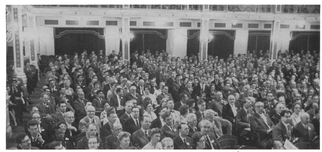
A section of the audience in the main hall of the Kursaal at Scheveningen during the Opening Session of the XI International Congress of Genetics