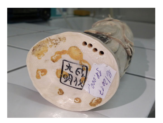
Figure 1A. Sampling sites for radiocarbon analysis in 2017 – sample 17_527.