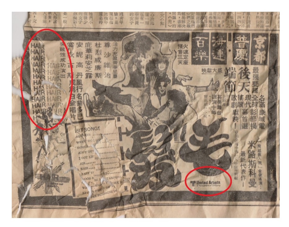
Figure 4. One of the two papers found inside the statuette Happy Fisherman. Marked parts are discussed in the text.

the movie Play It Again database was searched. The database contains foreign-language movies screened in Hong Kong from 1920 to the present, including titles of the movie in Chinese, the original titles, the release dates in Hong Kong, as well as other materials such as movie posters and advertisements in the Hong Kong press.