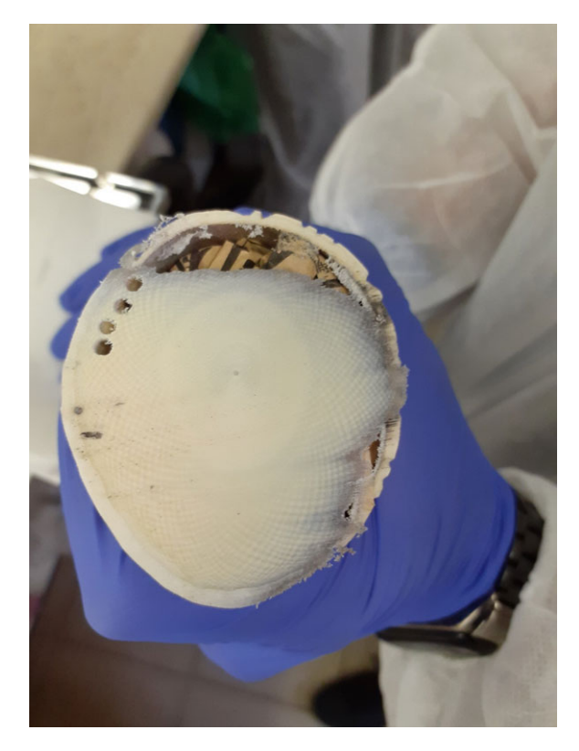
Figure 2. While opening the statuette, unexpected inner contents appeared.