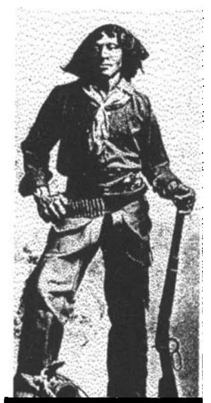
Announcing a new series, Blacks in the American West