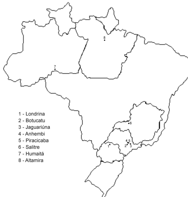
Figure 1 Map of Brazil showing the study sites