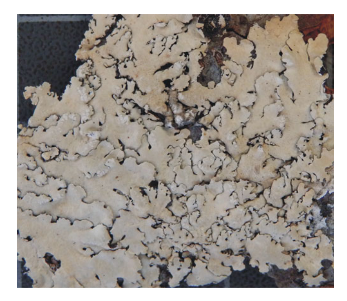
Fig. 2. Canoparmelia albaniensis, habit (P. Kirika 4649). In colour online

Notes. Canoparmelia albaniensis can easily be confused with C. texana in the field, but the former differs in having larger ascospores ( 11.0-14.5 \mu m long) and inconspicuous maculae on the upper surface. Furthermore, in molecular phylogenetic reconstruction C. albaniensis does not form a sister relationship with C. texana but with a non-sorediate African species, C. nairobiensis (Fig. 1). It is also morphologically similar to C. aptata (Kremp.) Elix & Hale, which differs in containing perlatolic acid.