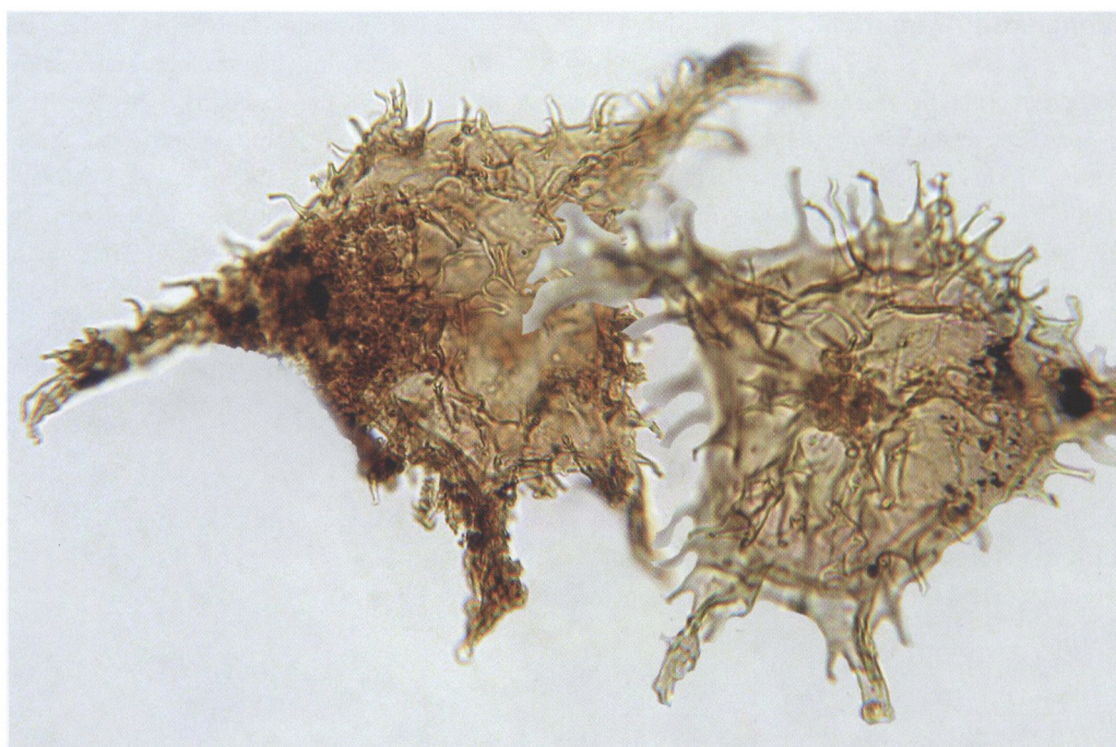
Fig. 2. Two specimens of the dinocyst Apectodinium augustum from the PETM of Lomonosov Ridge, recovered during IODP Expedition 302.

One prominent example of biotic change associated with the onset of the CIE is recorded along continental margins, where sediment sequences from all latitudes contain high abundances of dinoflagellate cysts belonging to the subtropical genus Apectodinium (Fig. 2) (Crouch et al., 2001; Sluijs et al., 2007a). In part, this must be associated to the PETM warming. However, in stratigraphically expanded marginal marine sections from the New Jersey Shelf and the North Sea, as well as a section in New Zealand, the onset of the Apectodinium acme started some 5 kyr prior to the CIE (Sluijs et al., 2007b) (Fig. 3). Additionally, the onset of the PETM SST warming at New Jersey appears to have led the CIE by several thousands of years (but lagged the onset of the Apectodinium acme) (Sluijs et al., 2007b). This disparity indicates that warm SST was not the only environmental control on Apectodinium abundances. Moreover, it suggests that the carbon release that caused the CIE was a result of initial climate change and acted as a positive feedback. This scenario fits the model of CH 4 release from submarine hydrates causing the CIE (Dickens et al., 1995). If this pre-CIE warming