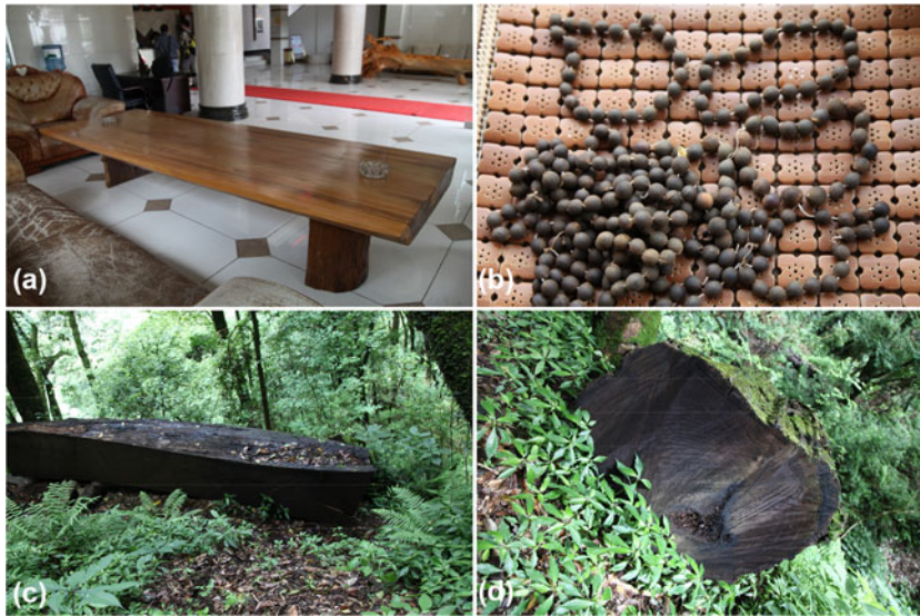
PLATE 1 Furniture made from the wood of C. chago (a), seeds traded in an agricultural market (b), and felled individuals (c & d).