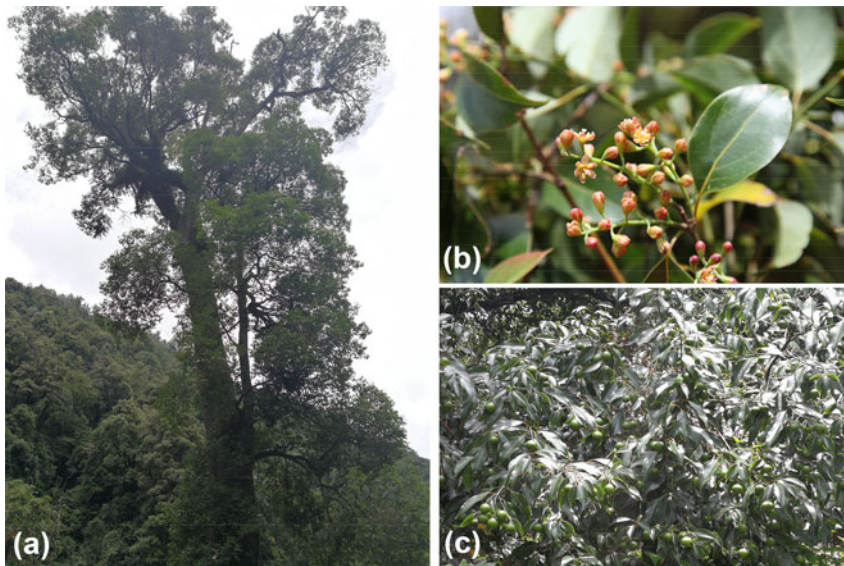
PLATE 2 Cinnamomum chago (a), and its flowers (b) and fruits (c).