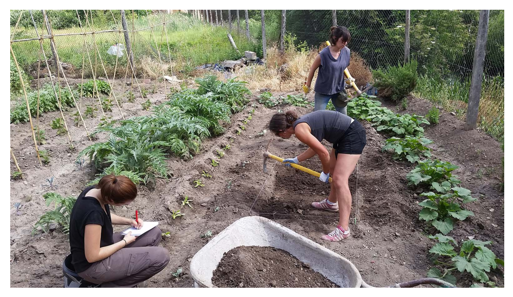
Figure 5. Excavations of a medieval irrigation channel in the town of Molina de Aragón (figure by Aleks Pluskowski).

the ability of conquered communities to adapt to the imposition of a new regime. Environmental exploitation is an increasingly used index of this resilience. From this, the LoR project will develop visual and digital resources to enable public beneficiaries to engage with the cultural landscapes associated with the iconic monuments of frontier authorities.