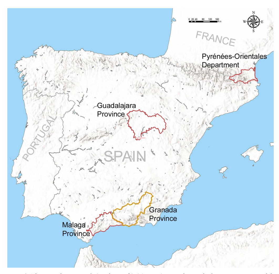
Figure 4. The case-study regions in the 'Landscapes of (Re) Conquest' project, showing the three primary regions and the secondary study region of Granada (figure by Aleks Pluskowski).

archaeology remain segregated from each other, more broadly from historical research, and from how these sites are presented to the public. We will integrate animal and plant remains, alongside palynological, geoarchaeological and biomolecular data, as well as the better-known historical sources, to map changes in natural resource exploitation and their connections with social and ideological transformations associated with regime changes in our selected case-study regions (Figure 5). One of the most important indicators of these changes will be long-term changes in diet based on multi-proxy data. Food culture in frontier societies connected the dietary choices of individual households with nearby rural provisioning and longer-distance trade networks (e.g. García García 2019).