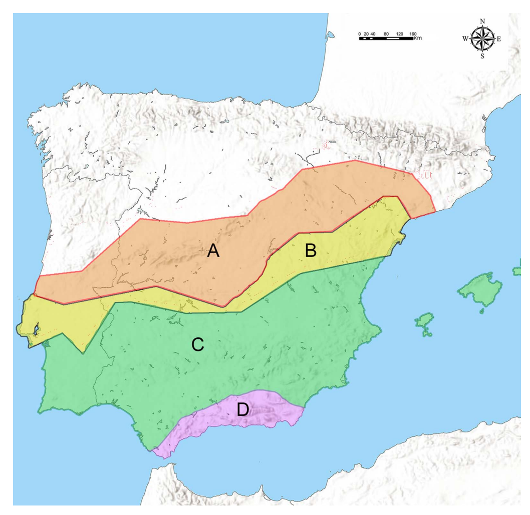
Figure 1. Map showing the process of the Christian conquests of Iberia: A) Christian conquests of Islamic Taifa kingdoms and lands of Almoravid Emirate, AD 1080–1130; B) Christian conquests of lands of Almoravid Emirate and Almohad Caliphate, AD 1130–1210; C) Christian conquests of lands of Almohad Caliphate, AD 1210–1250; D) Christian conquests of Nasrid Emirate, AD 1480–1492 (figure by Aleks Pluskowski).

with public and scholarly perceptions of this problematic term, the use of '(re)conquest' in the LoR project is deliberate.